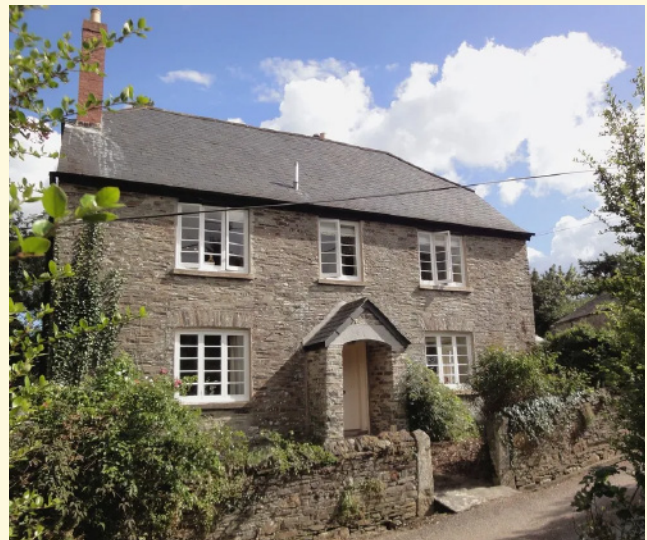
MARISTOW BARTON Milton Combe, Devon