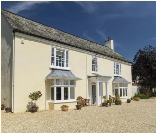
ABBOTS MANOR Combe Raleigh, Devon

Well, despite working very hard for weeks on the idea, it's been very hard to find exactly what we want! The brief was: different areas, 5-star luxury, maximum 7 ensuite double rooms, dining room, lounges, large kitchen(s). Self-catering but with breakfasts and dinners organised between ourselves plus drinks excluding spirits. Cliff and Lorraine will be acting as host and hostess. We have found two venues both in the southwest that have space. Our hope for West Wales has sold out. Our other hope for Norfolk is also sold out. So we offer the two we have as samplers, which are in excellent areas and lovely properties.