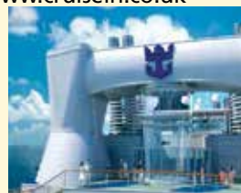
RIPCARD BY iFLY™ First sky-diving simulator at sea.

from Cape Liberty in New Jersey and will cruise to the Caribbean and the Bahamas. Her durations will range from two to eleven nights.