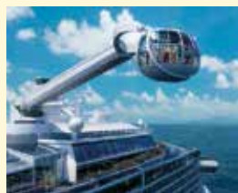
NORTH STAR™ A spectacular journey more than 300 feet above sea level.